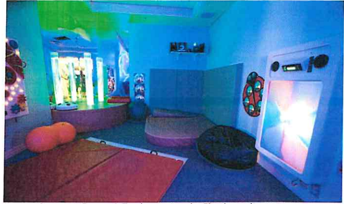
Concept Room & Equipment only-Final results may vary.

While those initiatives are still a priority, another need has been identified in late 2024 to upgrade the Sensory Spaces within our Adult Training Facilities (ATF) beginning with our Quakertown Location. A sensory room is a place designed to engage, relax or stimulate the senses. It's a special environment filled with materials that heighten senses through lights, colors, sounds, and tactile objects. These rooms are tailored to provide sensory experiences that can be controlled to suit individual needs making them a haven for therapeutic, educational and behavioral purposes. With your contribution, the ATF can be outfitted with all new, updated sensory equipment of a variety of sizes and purposes to benefit many individuals served.