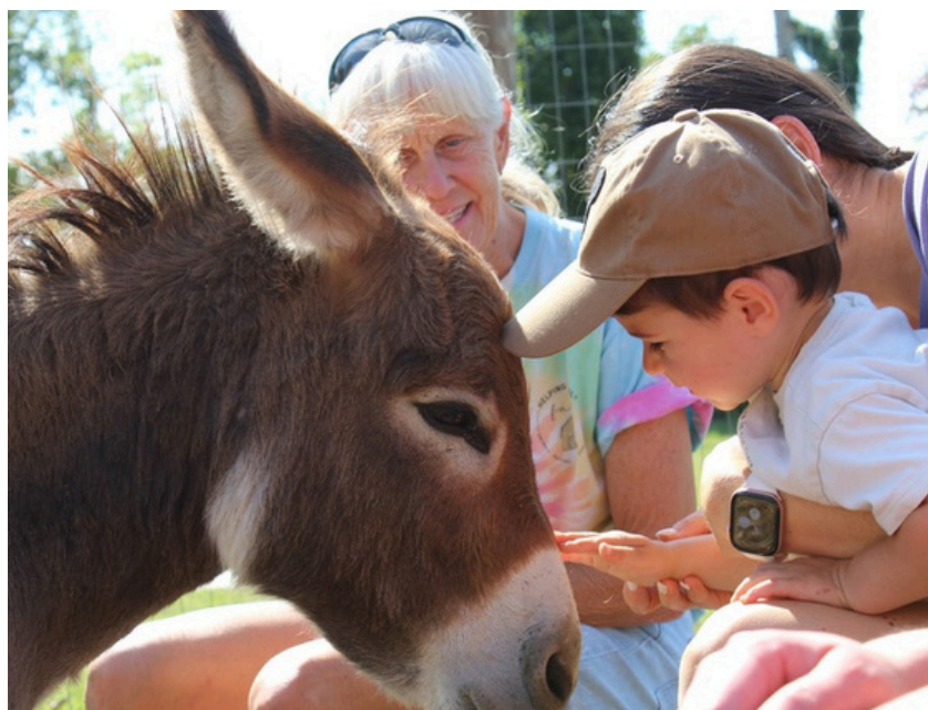
(Top) Families and Interventionists enjoyed a mini-Fall Outing at the park. (Bottom) An EI Interventionist looks on while a supported child interacts with a donkey at Helping Friendly Farm in New Hope, PA.