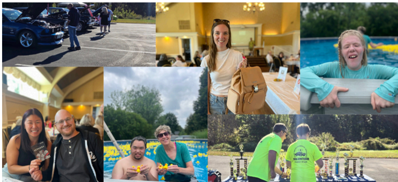
Our most recent fund raising and community events including our Fall Classic Car Show, Fall Bingo and Duck Derby!

Throughout this period, our Cash and Prize Calendar Raffle and Gift Card Raffle engaged the community with daily chances to win, thanks to generous donations from local businesses and supporters. Each fundraiser not only helped us meet our financial goals but also strengthened the bonds within our BARC family, ensuring we can continue to provide quality supports and opportunities for those we serve.