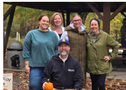
BARC Early Intervention Administrative Team at Core Creek Park.

We're grateful to everyone who joined us and made these outings so special. Here's to more opportunities for growth, connection, and joy!