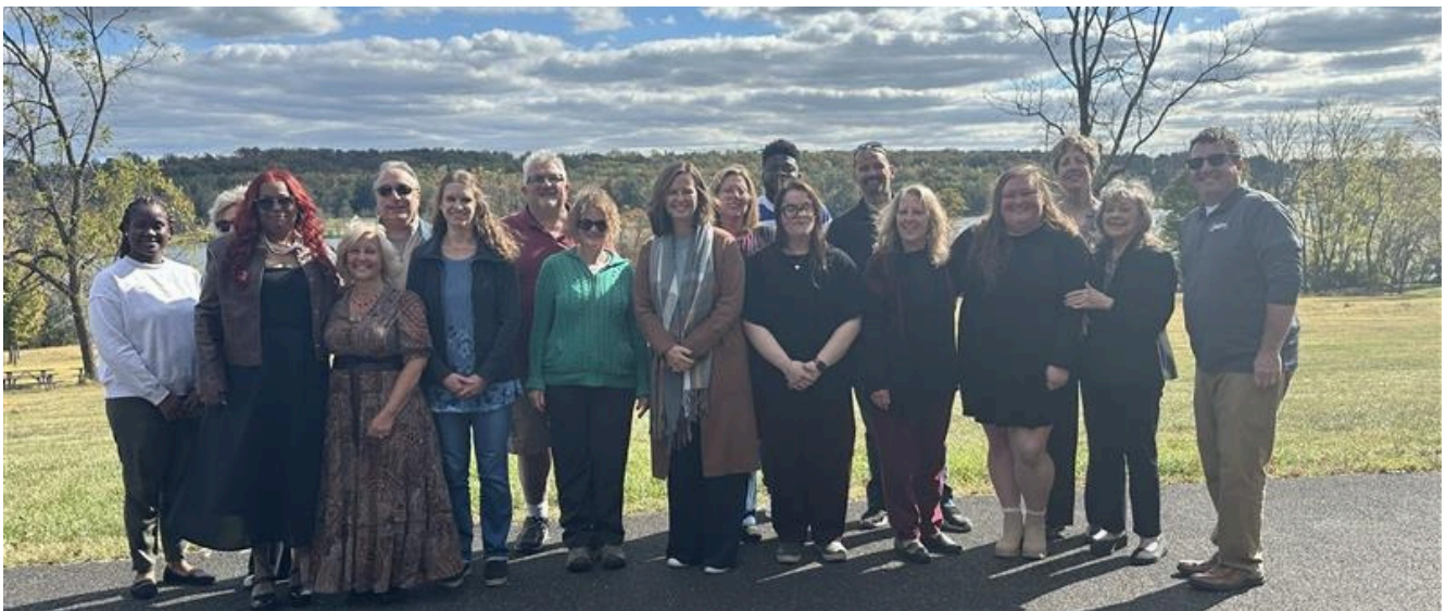
Congratulations to the 2025 Length of Service Recipients.

This year's honorees represent years of dedication to supporting individuals with intellectual disabilities and autism. From five years to thirty five years of service, each recipient has contributed to creating inclusive environments, fostering independence, and enriching lives. Their efforts remind us that progress is built on the steady foundation of care and compassion.