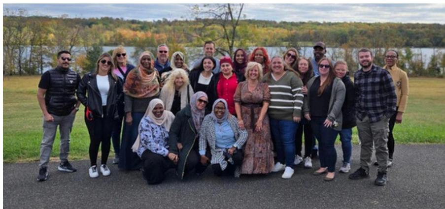
The Warminster Team who attended the 2025 Length of Service Award Ceremony.